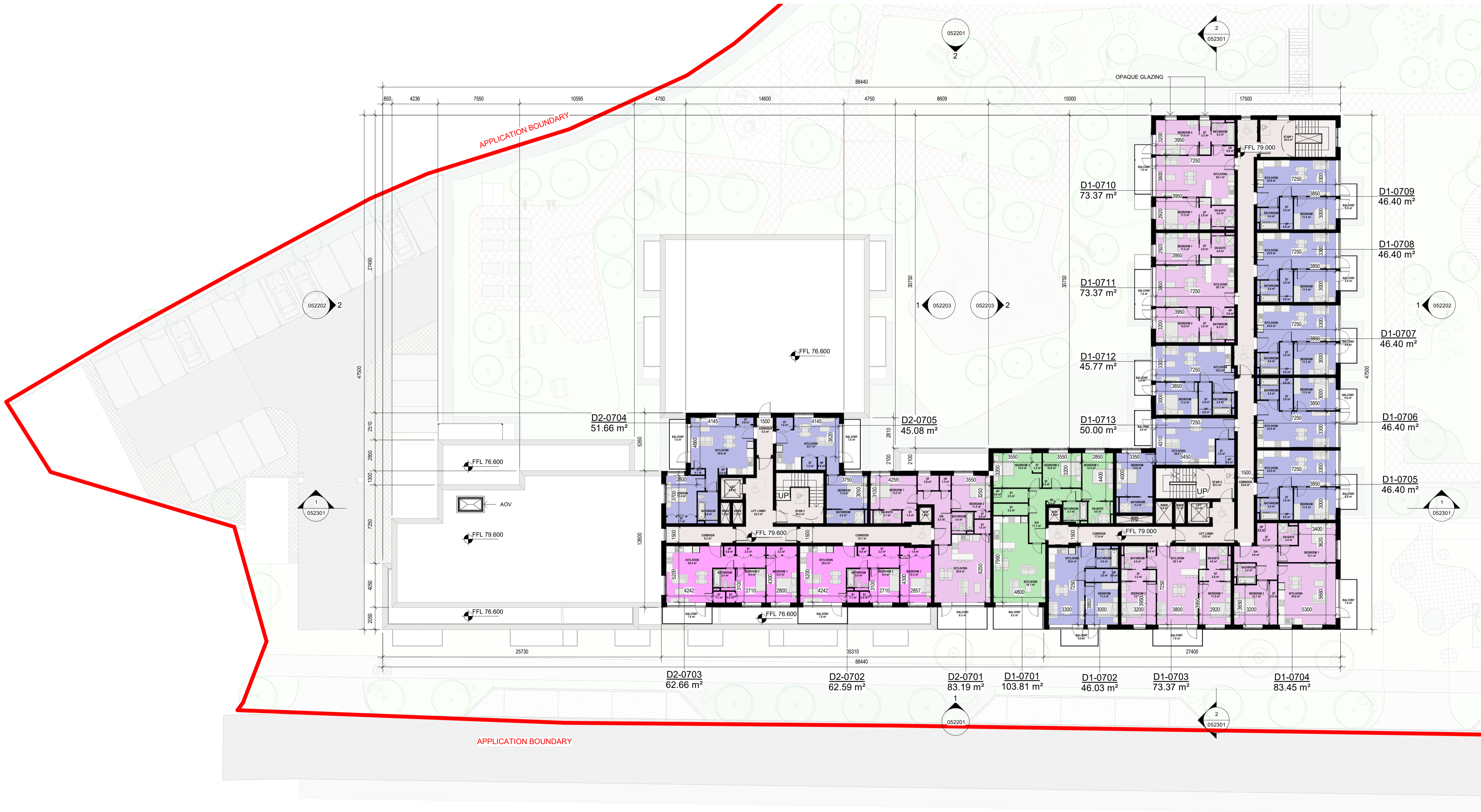
1 BLOCK D -L07-SEVENTH FLOOR PLAN 1 : 200

Please consider the environment before printing this sheet